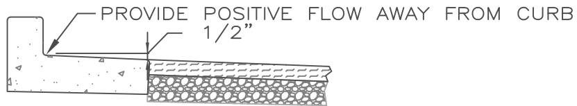
"DUMP" CURB OPTION